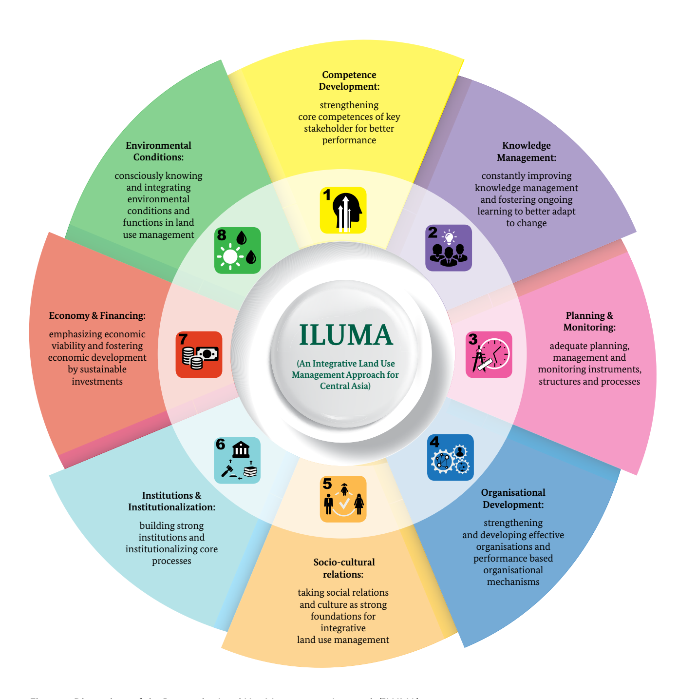
Figure 1: Dimensions of the Integrative Land Use Management Approach (ILUMA)

Negative impacts of land-use changes are conceived as the result of complex interactions between these different dimensions. ILUMA thus addresses not just the key challenges of land use management – which are related to desertification, land degradation, or climate change adaptation – but also those challenges related to peoples' behaviours, cultures, interests and conflicts, environmental management, sector policies, and organisational development, as well as technical solutions to prevailing problems.