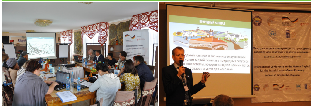
Training on adaptation to climate change for media representatives in Bishkek, Kyrgyzstan.